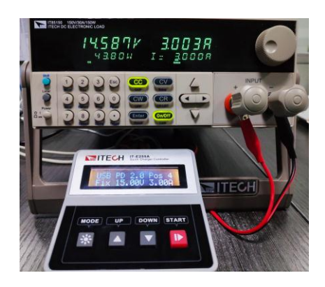
USB PD 2.0 POS4 15V/3A