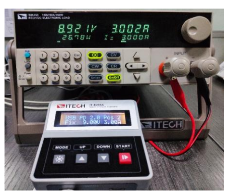
USB PD 2.0 POS2 9V/3A