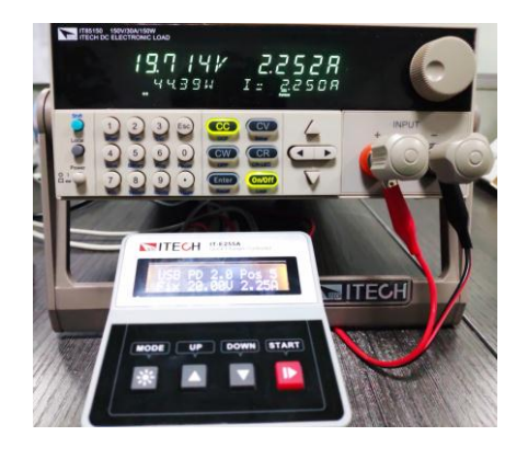
USB PD 2.0 POS5 20V/2.25A

Load maximum current under the five PD positions