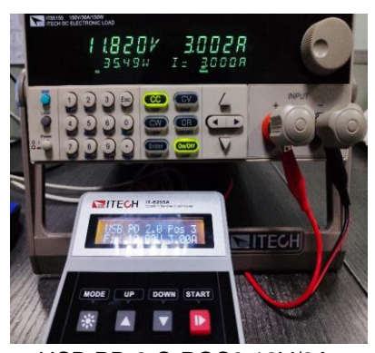
USB PD 2.0 POS3 12V/3A