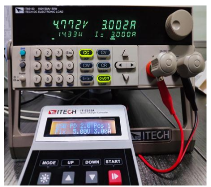
USB PD 2.0 POS1 5V/3A